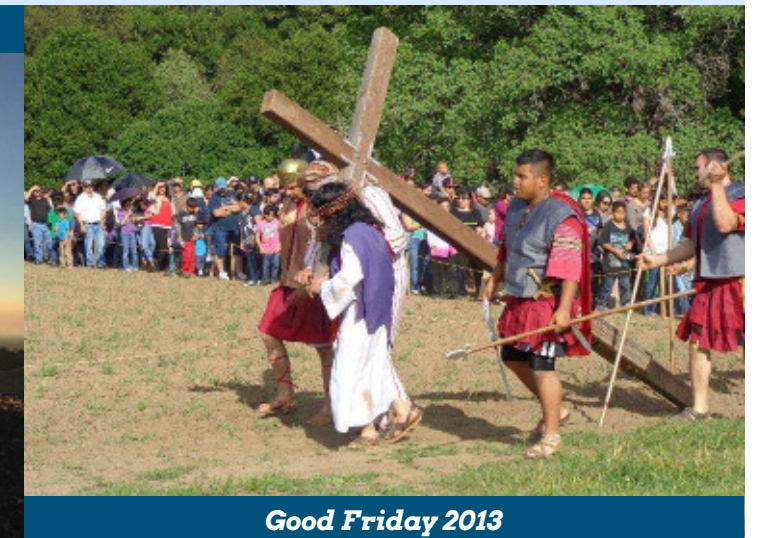
Good Friday 2013