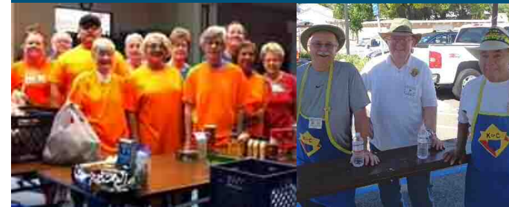
Knights of Columbus